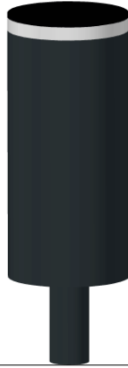
Ø 10.62/H23.6 40 lbs