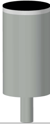
Ø12.52/H23.6 65 lbs