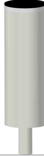
Ø10.62/H31.4 80 lbs